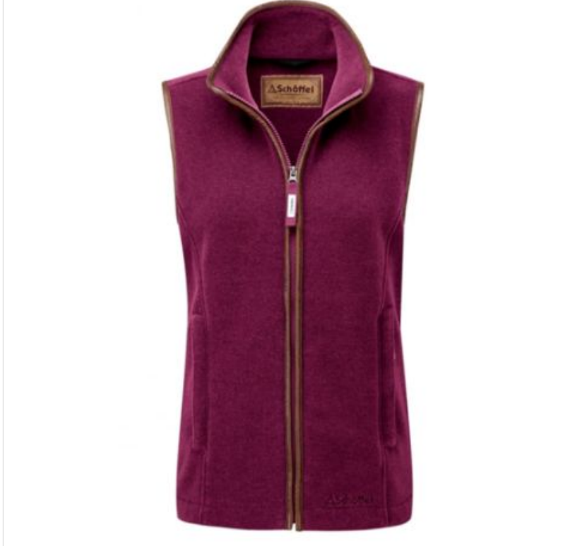
Our Price: £139.96