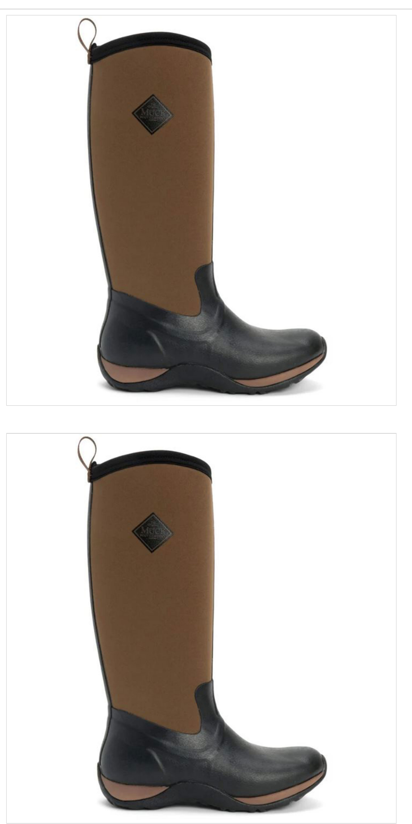
Our Price: £82.5