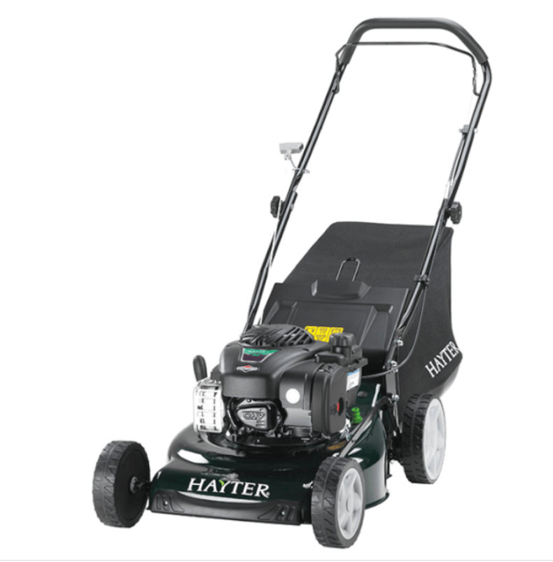
Our Price: £399.99