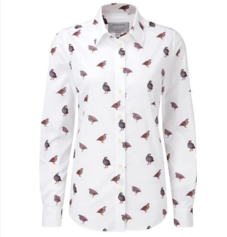
Our Price: £79.96