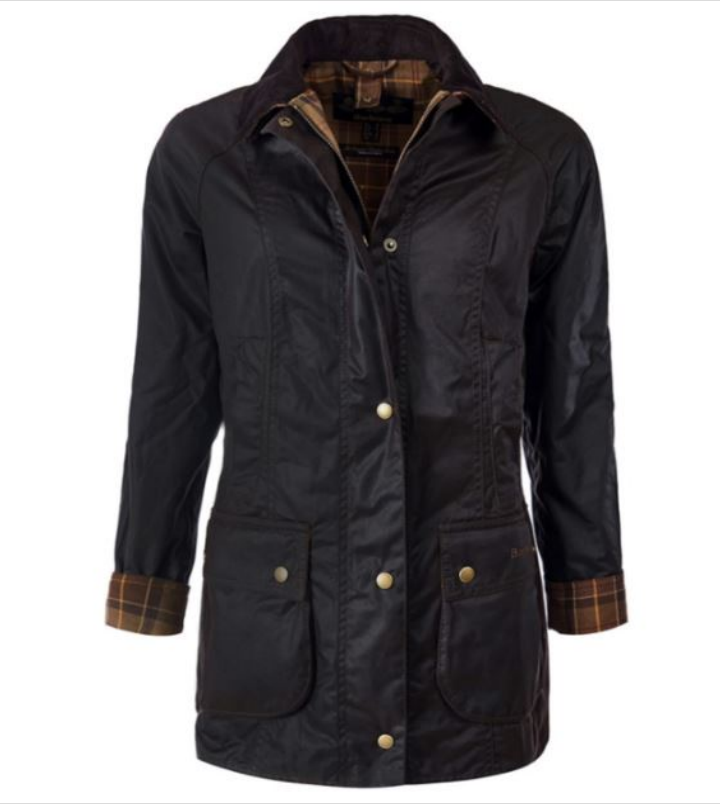
Our Price: £119