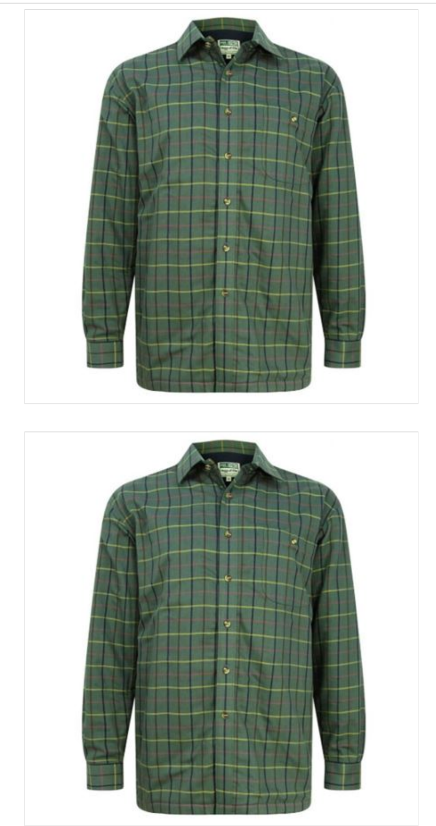
Our Price: £44.95