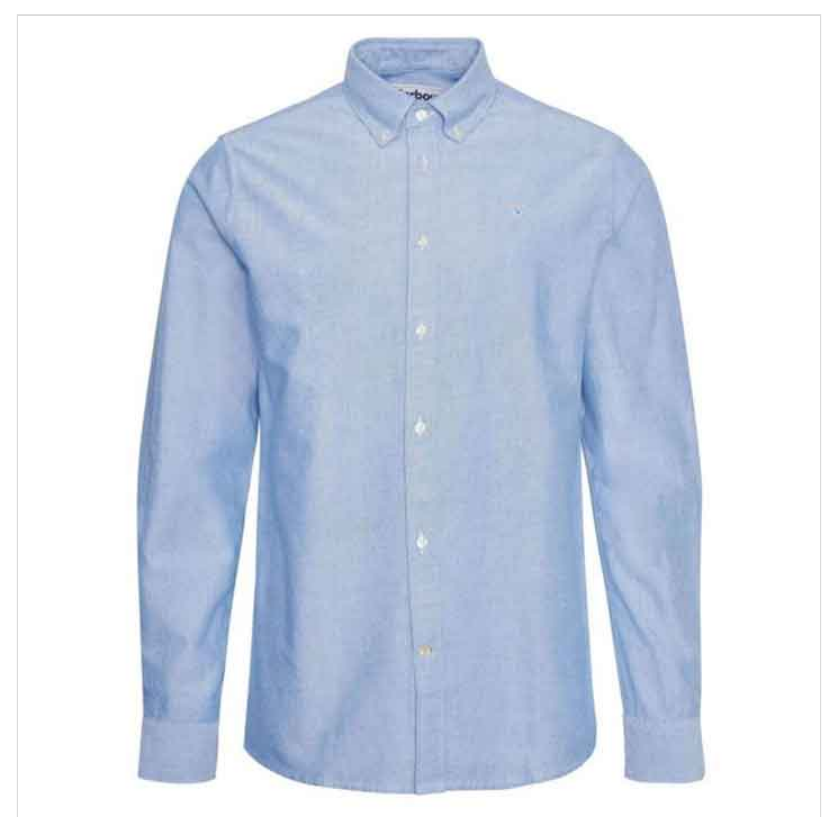
Our Price: £69.95