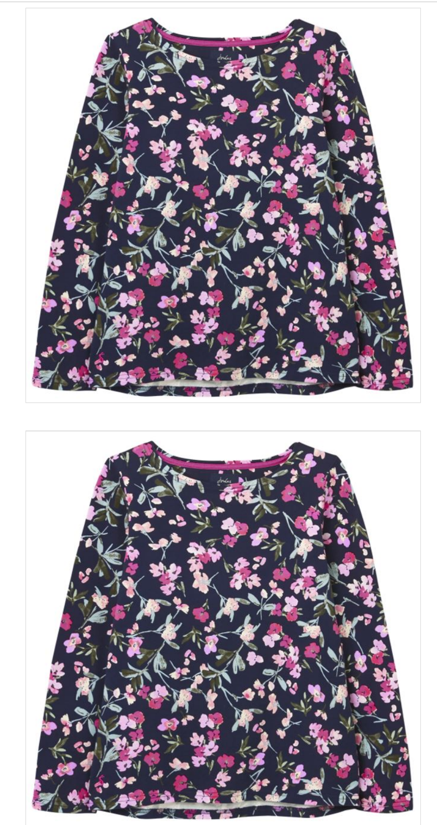
Our Price: £9.95