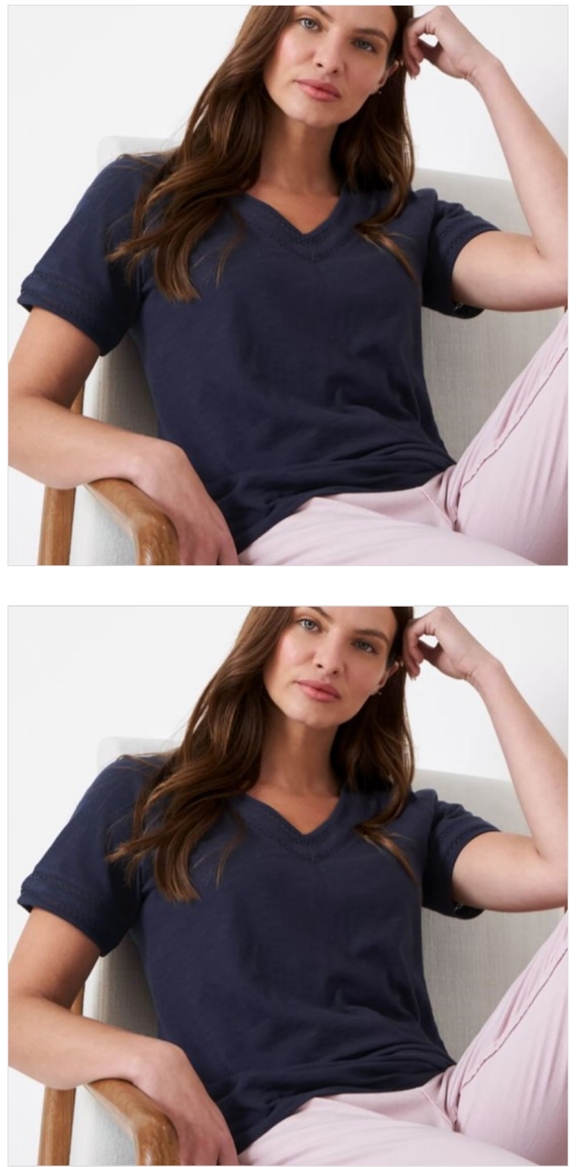
Our Price: £15