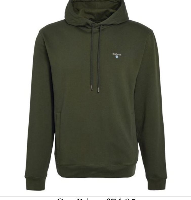
Our Price: £74.95