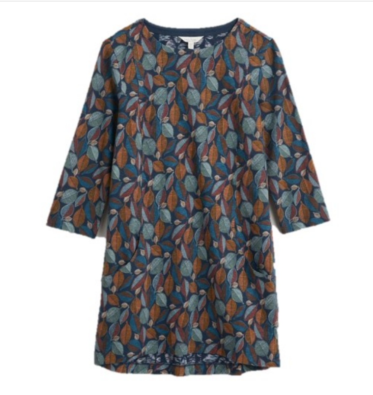
Our Price: £19.95