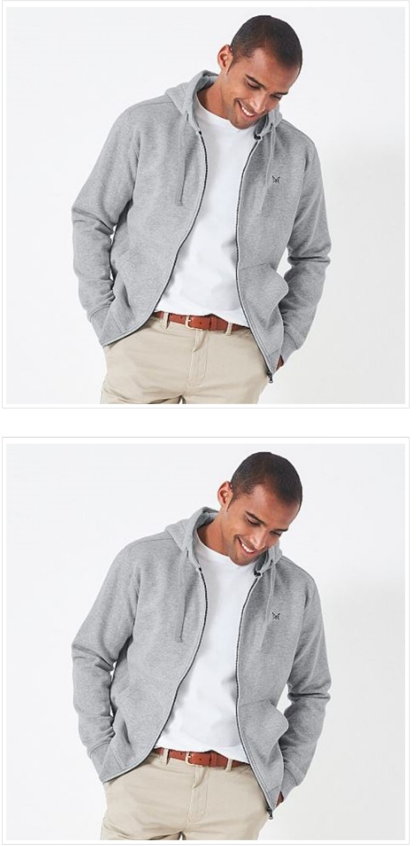
Our Price: £65