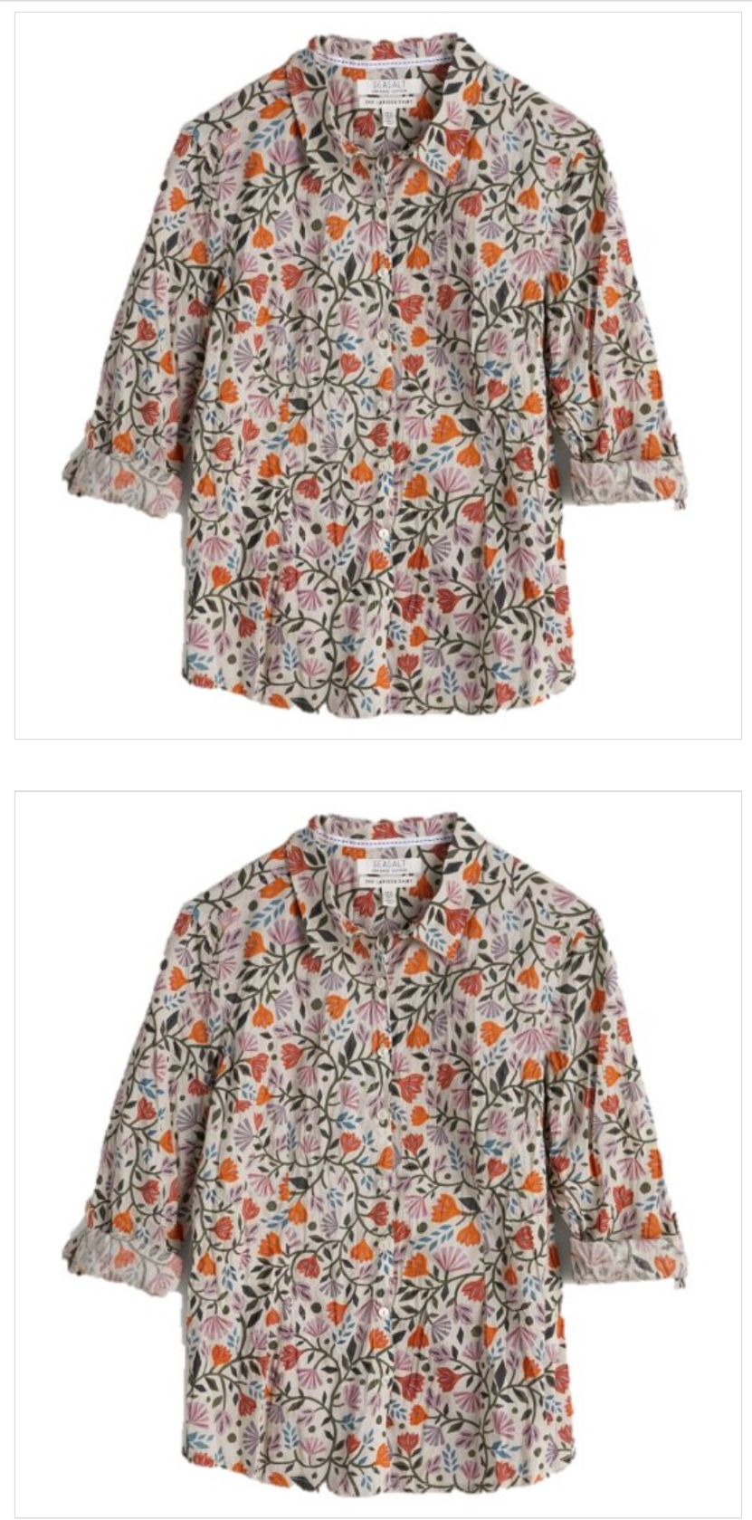
Our Price: £28