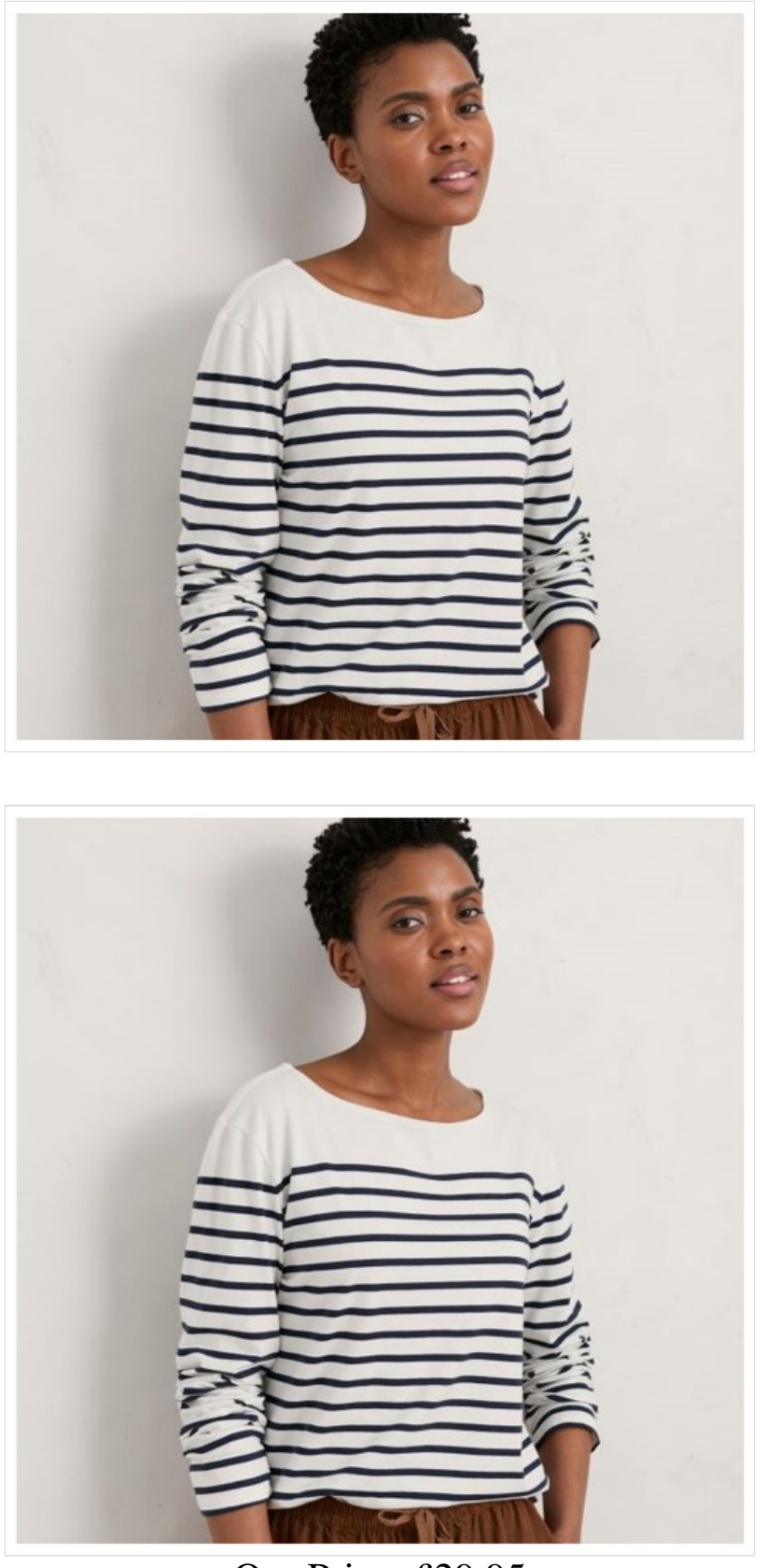
Our Price: £29.95