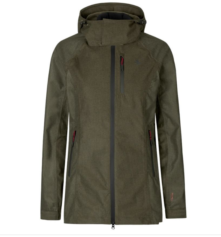
Our Price: £90