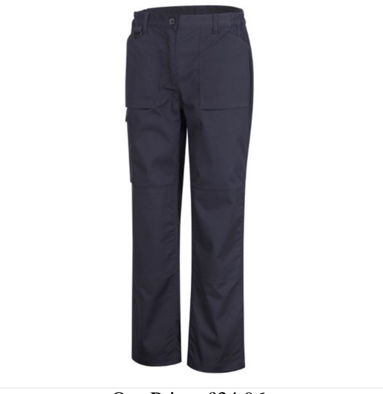
Our Price: £34.96