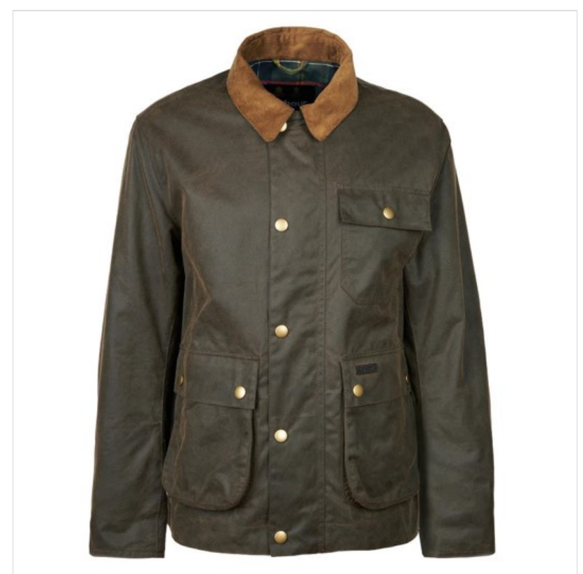
Our Price: £249