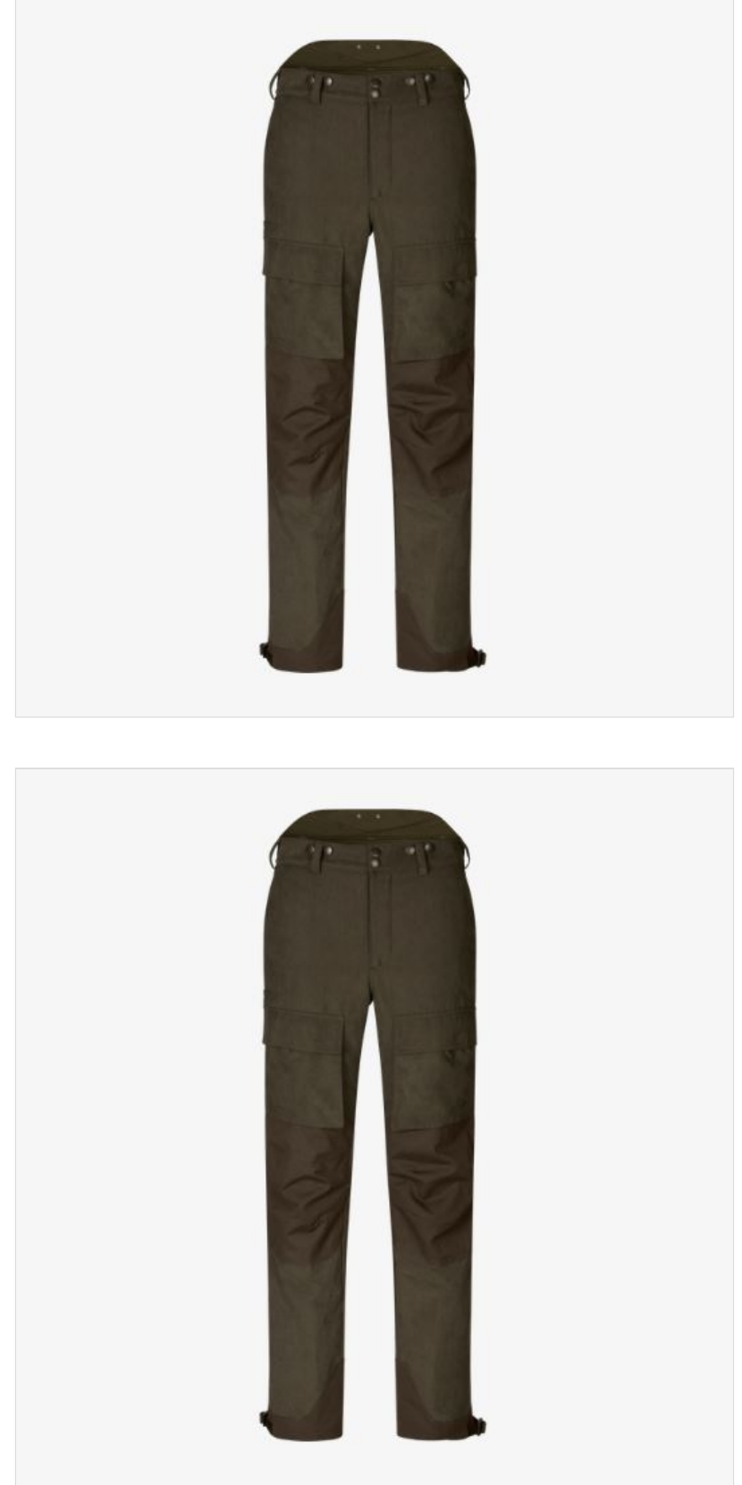
Our Price: £164.99