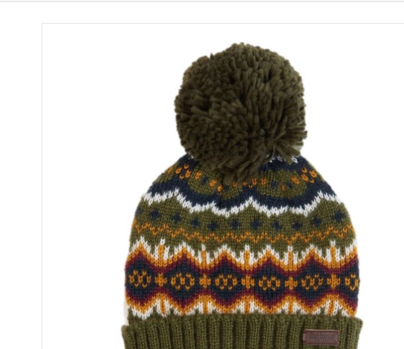
Our Price: £26.95