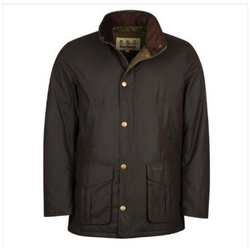
Our Price: £209